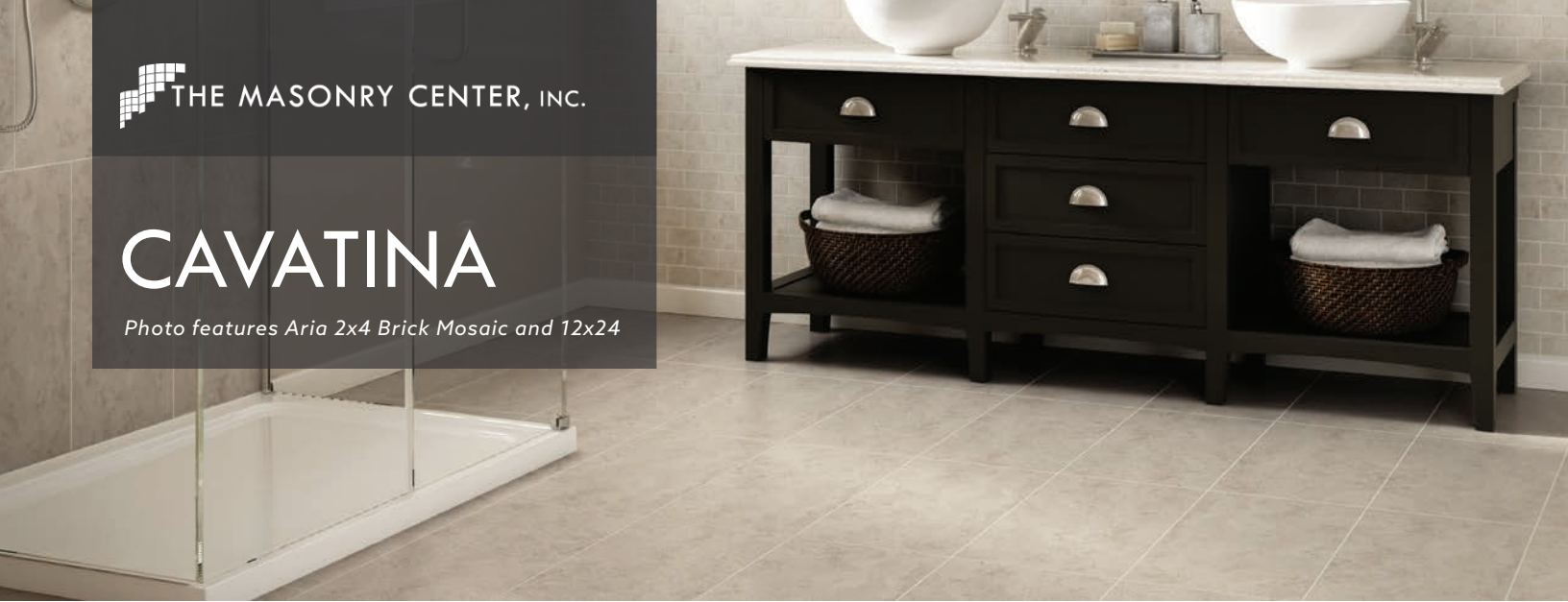
Photo features Aria 2x4 Brick Mosaic and 12x24