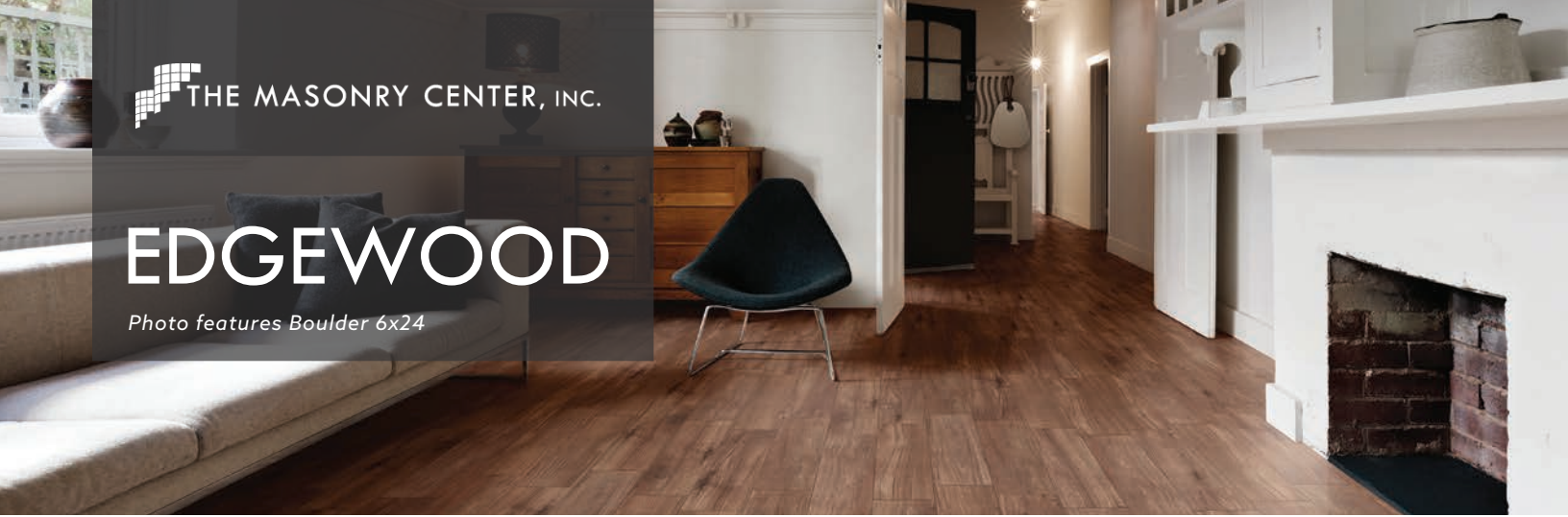
Photo features Boulder 6x24